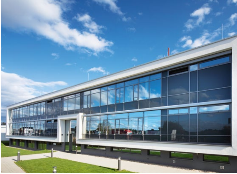
Company headquarters of Nabaltec AG, Schwandorf